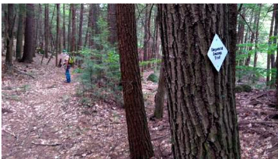
New Signage on Trail