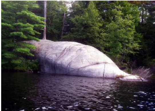
Whale Rock at Kilburn Pond