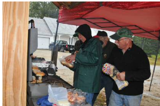
The Barbeque at the Picnic