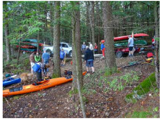
Canoes at the Reservoir Outing