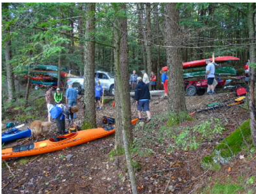
Canoes at Reservoir