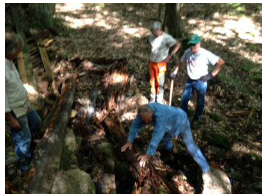
Working on the Trails