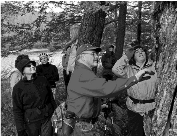
Rest Stop and Tree Study