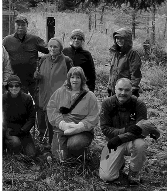
Hiking Group in Park