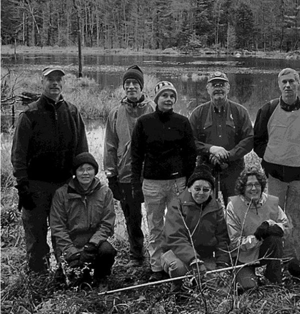
Hiking Group in Park