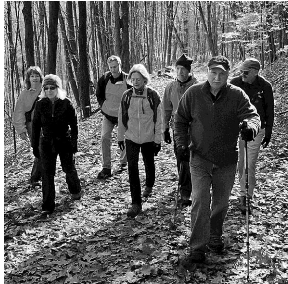
Hiking Back Up to Horseshoe Trailhead