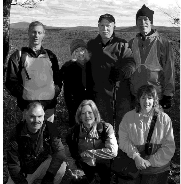
At a Viewpoint Hiking in Pisgah